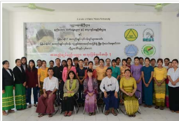
Group Photo on Opening Ceremony Day

Garment Skill Development Training's (ToT Program) Opening Ceremony & Closing Ceremony Photo Gallery