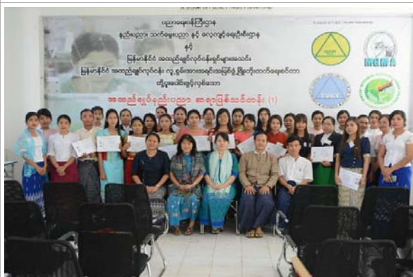
Group Photo on Closing Ceremony Day