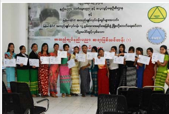
The Trainees from Garment Skill Development Training 1 (ToT Program)