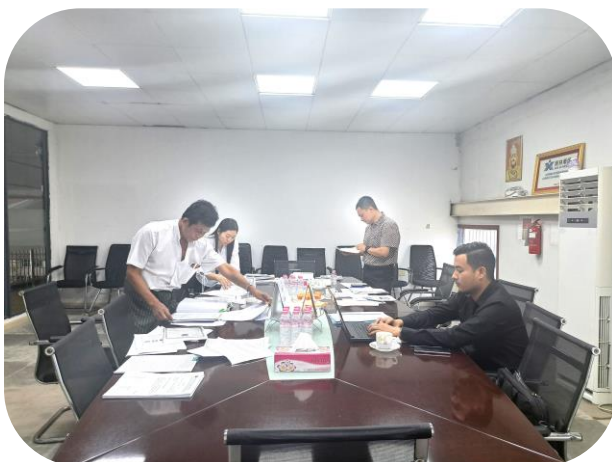
Saiform International Garment (Myanmar) Co.,Ltd