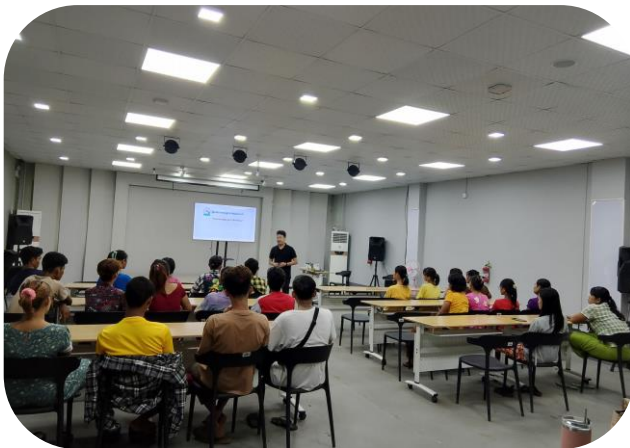
MGMA Conducting Labour Law Awareness