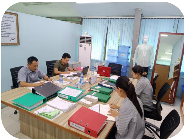
Myue & Sue Garment MFG Co.,Ltd

Senior Labour Officer of MGMA scrutinized all the documents relation to the VLCA. Voluntary Labour Compliance Assessment is an assessment tool implemented by the collaboration project between MGMA and ILO/ACTEMP, Bureau for Employer Activity under International Labor Organization, in 2019. VLCA was officially launched on 17 th February 2020 by MGMA to all its member factories.