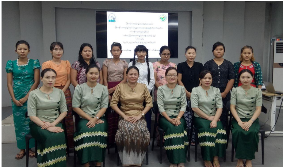
Batch – 7 Group Photo

M yanmar Garment Manufacturers Association (MGMA) organized Advanced Sewing Machine Operator Training (Batch – 7) was held on June 24 th to July 5 th , 2024 at Myanmar Garment Human Resources Development Training Center (MGHRDC).