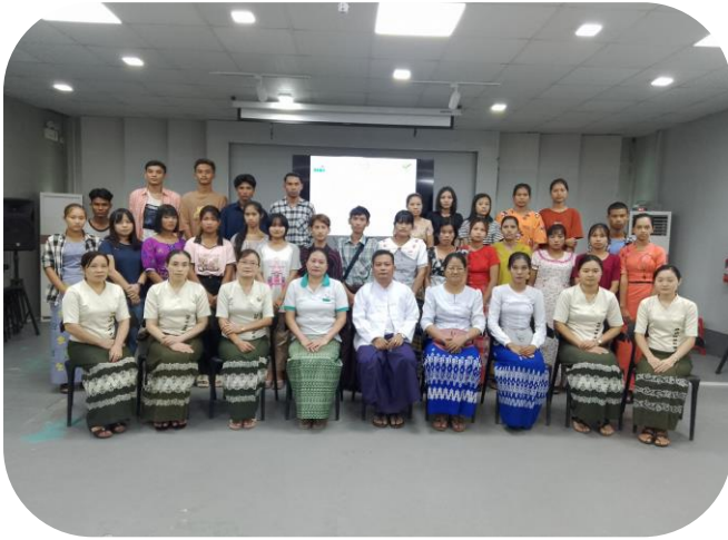
Batch – 240 Group Photo

B asic Sewing Machine Operator Training (Batch – 240) was held on from June 24 th to July 12 th , 2024 at Myanmar Garment Human Resources Development Training Center (MGHRDC), organized by Myanmar Garment Manufacturers Association (MGMA).