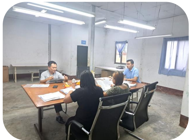
Sinoproud Myanmar Garment Co.,Ltd