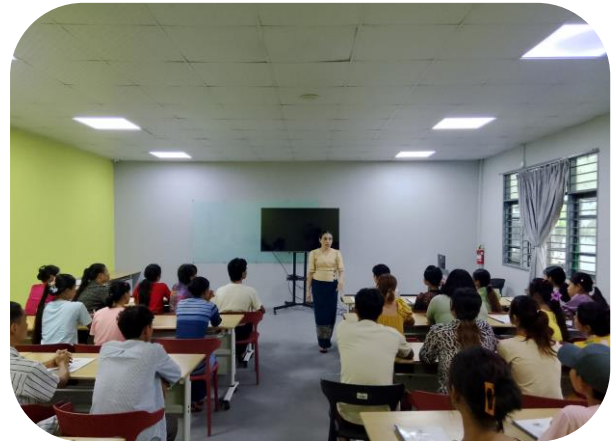
Trainer of MGHRDC presenting Sewing Method