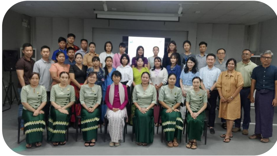
Batch – 81 Group Photo

M yanmar Garment Manufacturers Association (MGMA) organized Industrial Engineering in garment industry (10 days) Training (Batch – 81) was held from July 29 th to August 9 th , 2024 at Myanmar Garment Human Resources Development Center (MGHRDC).