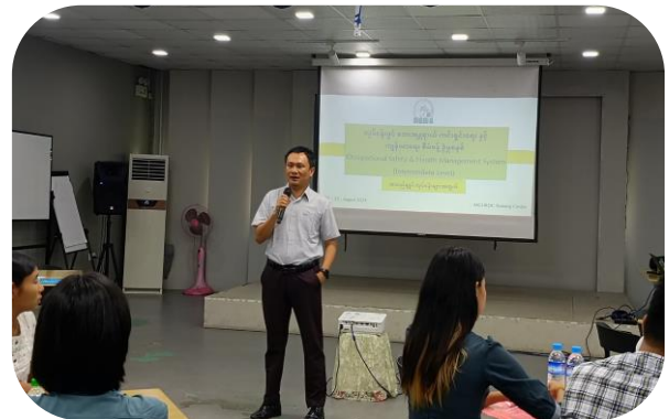
Senior Labour Officer of MGMA giving opening remarks