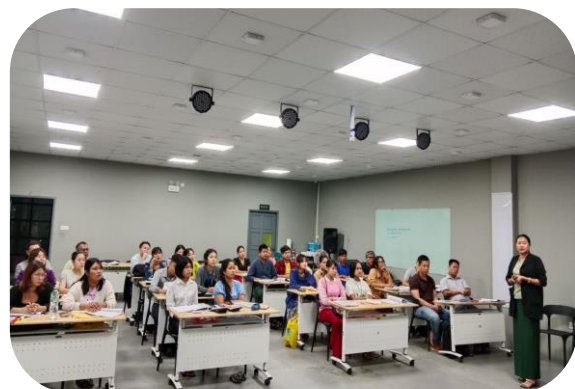
Trainer of MGHRDC presenting Sewing Method