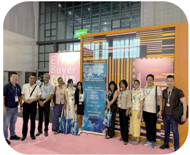
Buyer Delegates Group Photo