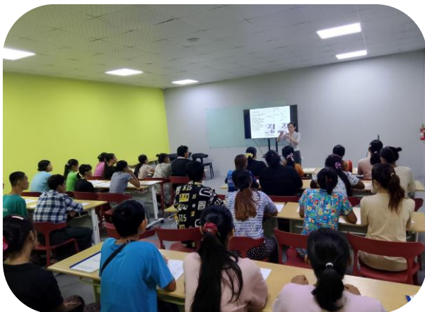
Trainer of MGHRDC presenting Sewing Method