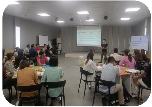
Labour Officer Team presenting OSH