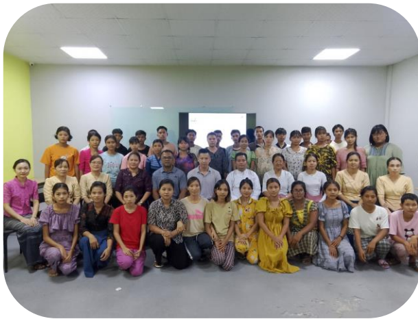
Batch - 241 Group Photo

B asic Sewing Machine Operator Training (Batch – 241) was held on August 5 th to 23 rd , 2024 at Myanmar Garment Human Resources Development Training Center (MGHRDC), organized by Myanmar Garment Manufacturers Association (MGMA).