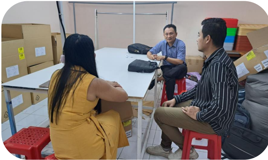
Merry Queen Co.,Ltd

Senior Labour Officer of MGMA scrutinized all the documents relation to the VLCA from Merry Queen Co.,Ltd on August 2. Voluntary Labour Compliance Assessment is an assessment tool implemented by the collaboration project between MGMA and ILO/ACTEMP, Bureau for Employer Activity under International Labor Organization, in 2019. VLCA was officially launched on 17 th February 2020 by MGMA to all its member factories.