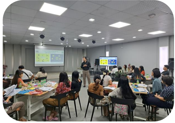
Labour Officer Team presenting OSH