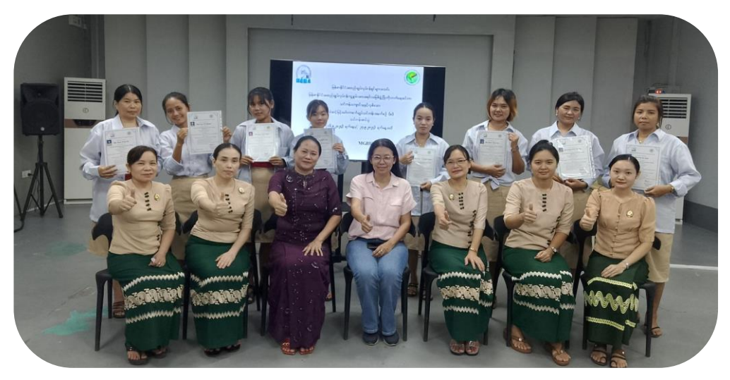
Batch - 8 Group Photo

In this course, the trainer conducted parts of the fabric such as bag cover, spiral, shoulder corner seam, pocket, different types of bags, simple zip method, how to install a zipper, sewing sailor's tongue, long sleeve shirt and "A" skirt with belt. In addition, (6) special sewing method such as Buttonhole sewing machine, how to sew button using sewing machine , Bartack Machine, Overlock 4 thread, Overlock 5 thread, 2 Needle taught by trainers from MGHRDC with practice session. The training attended by (8) trainees.