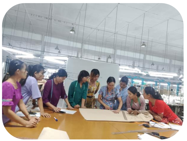
Trainer from MGHRDC presenting sewing method