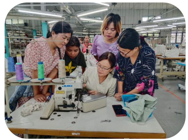
Trainer from MGHRDC presenting sewing method