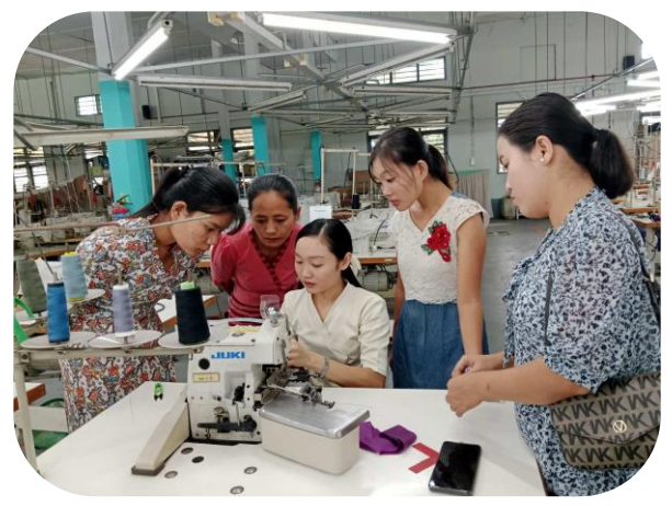
Trainer from MGHRDC presenting sewing method