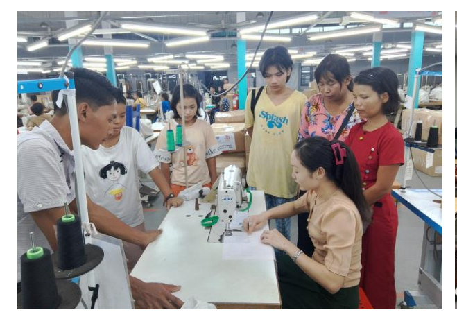
Trainer from MGHRDC presenting sewing method