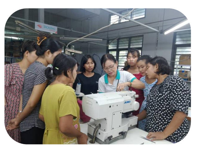
Trainer of MGHRDC presenting Sewing Method