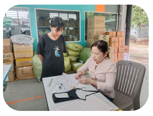
Trainer of MGHRDC presenting Sewing Method