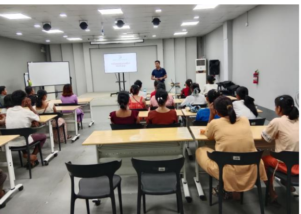
MGMA Conducting Labor Law Awareness