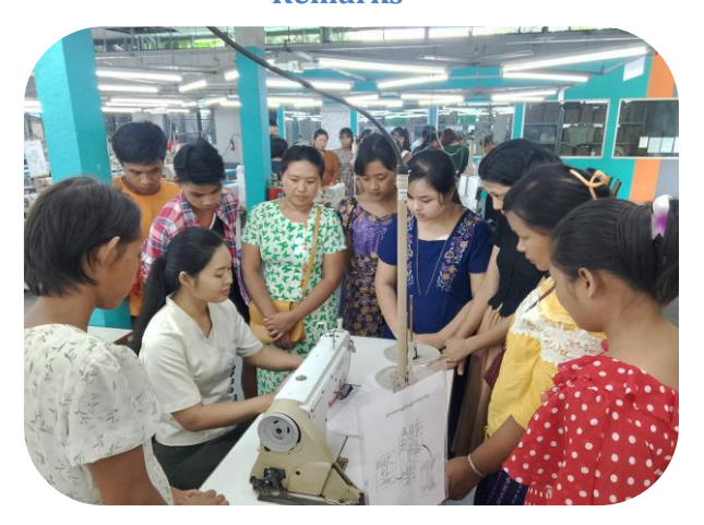
Trainer of MGHRDC presenting Sewing Method