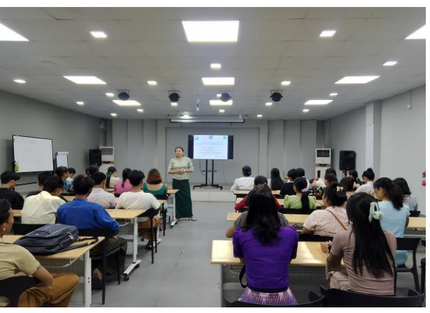
Manager of MCHRDC giving Closing Remarks