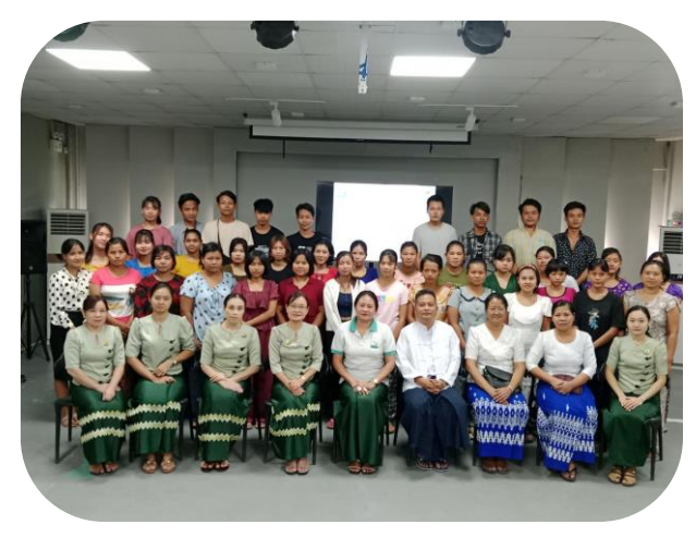
Batch - 243 Group Photo

asic Sewing Machine Operator Training (Batch – 243) was held on from September 16<sup>th</sup> to October 4<sup>th</sup>, 2024 at Myanmar Garment Human Resources Development Training Center (MGHRDC), organized by Myanmar Garment Manufacturers Association (MGMA).