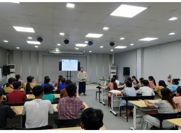
Principle of GTHS giving Opening Remarks