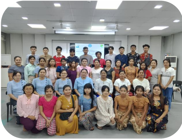
Batch – 246 Group Photo

B asic Sewing Machine Operator Training (Batch – 246) was held on from November 18th to December 6th, 2024 at Myanmar Garment Human Resources Development Training Center (MGHRDC), organized by Myanmar Garment Manufacturers Association (MGMA).