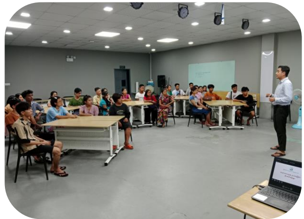
MGMA conducting Labor Law Awareness