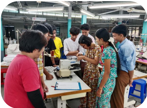
Trainer of MGHRDC presenting Sewing Method