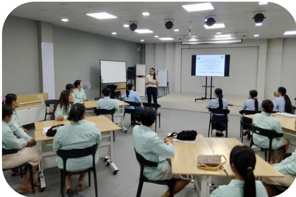
Executive Committee of MGMA giving closing remarks