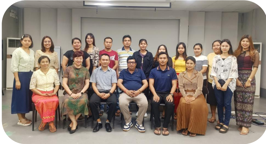
Batch – 4 Group Photo

Garment HR Management and Occupational Safety & Health Management System (OSH) Training (Batch – 4) was held on 2024, November 19 to 21 at Myanmar Garment Human Resource Development Center (MGHRDC), organized by Myanmar Garment Manufacturers Association (MGMA).