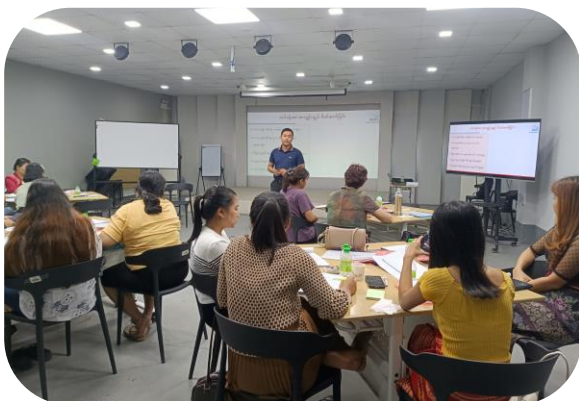
Junior Labor Officer of MGMA presenting OSH