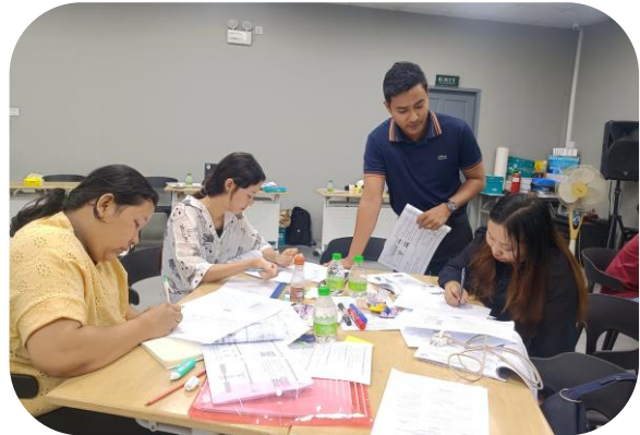
Junior Labor Officer of MGMA presenting OSH