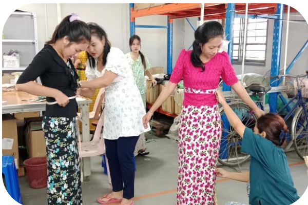
Trainer of MGHRDC presenting advanced sewing method