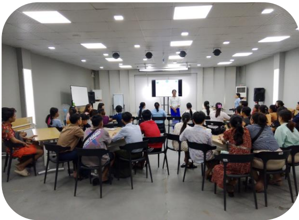
Associate Professor of GTHS giving Closing Remarks

and sewing method step by step with practice session. MGMA conducted the awareness of labour law in factory. Total (31) trainees attended the training and awarded certificate.