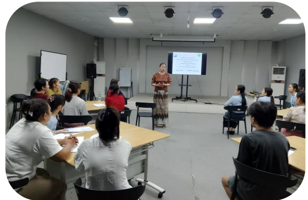
Manager of MGMA presenting advanced sewing method