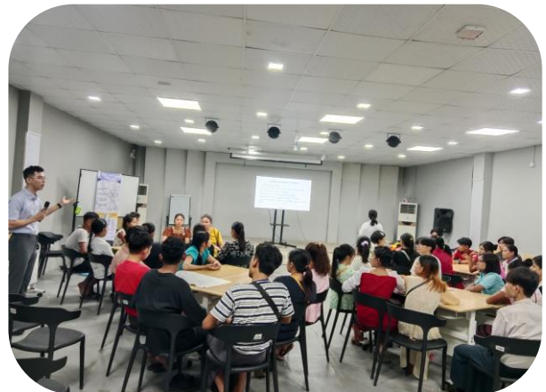
Trainer of MGHRDC presenting Sewing Method